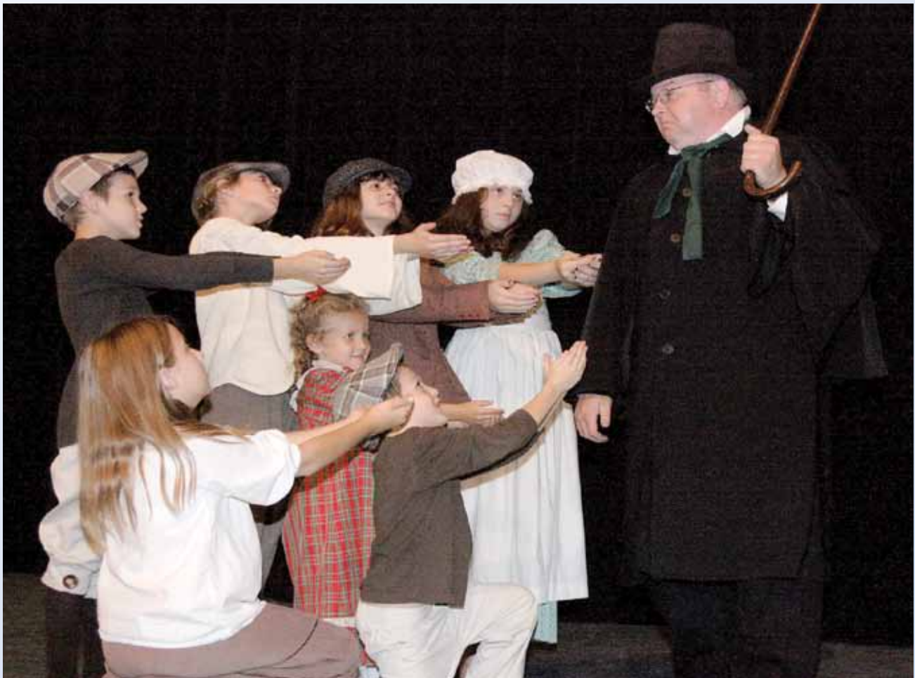
Mr. Scrooge and some hungry kids