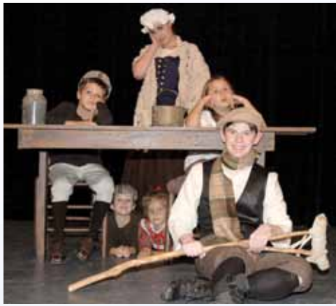
Tiny Tim and some other Cratchit kids wonder 'what's for dinner'